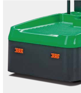
Front and rear flashing lights